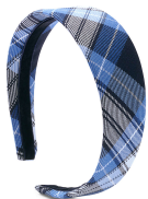
School Uniform Girls Clear Blue Plaid Headband by Lands' End.