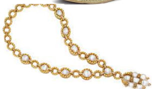
No Smartwatches, costume jewelry, or statement jewelry pieces. No Boots, high heel shoes, sandals, wedges, white leggings with socks