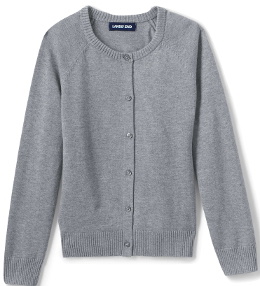
School Uniform Girls Cotton Modal Cardigan Pewter Heather (Must be monogrammed)