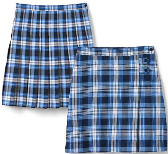
School Uniform Girls Skirt A-Line or Pleated Clear Blue Plaid (Must fall below the knee)