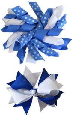
No hair accessories not in school uniform colors Or overly ornate