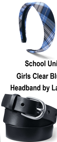
School Uniform Girls Clear Blue Plaid Headband by Lands' End.