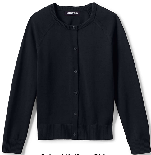
School Uniform Girls Cotton Modal Cardigan Black (Must be monogrammed & must have at least one for Special Events)