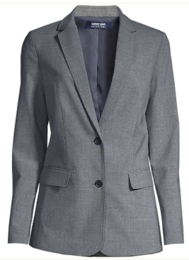
School Uniform Women's Washable Wool Two Button Traditional Blazer Light Charcoal (No Monogram)