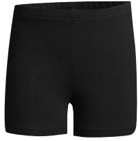
School Uniform Cotton Cartwheel Shorts Black (Does not have to be Lands' End)