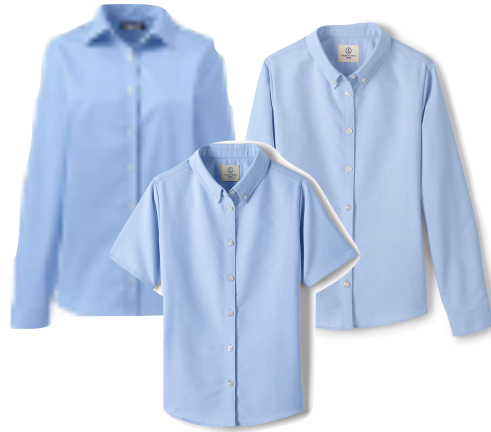
School Uniform Girls Oxford Dress Shirt, Regular, No Gape, or No Gape Stretch Shirt Long or Short Sleeve Blue(No Monogram)