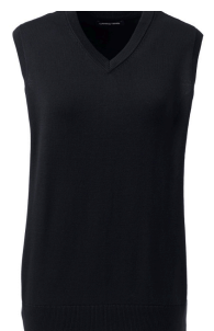
School Uniform Women's Cotton Modal Fine Gauge Sweater Vest, Black (Monogram)