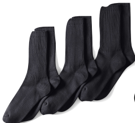
Black crew socks (Does not have to be Lands' End)