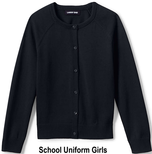
School Uniform Girls Cotton Modal Cardigan Black (Must be monogrammed, Must have at least one for Special Events)