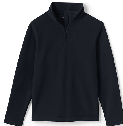
School Uniform Fleece Jacket or Quarter Zip Black (Must be monogrammed)