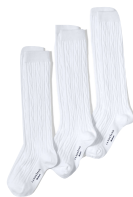
School Uniform Girls Solid Cable Knee Socks White (Does not have to be Lands' End)