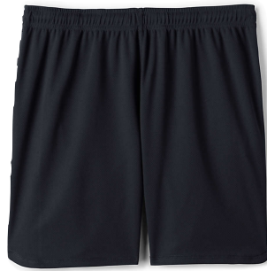
Black athletic or jogger shorts and/or Black sweat/track pants (Does not have to be Lands' End. White stripe on side is acceptable.)