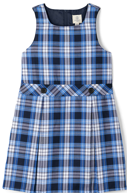
School Uniform Girls Uniform Jumper Clear Blue Plaid