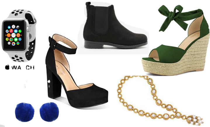
No Smartwatches, costume jewelry, or statement jewelry pieces. No Boots, high heel shoes, sandals, wedges, white leggings with socks