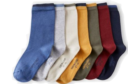
No colored socks other than black No white socks. No patterned socks.