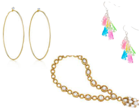
No Hoop earrings or statement jewelry including Rings and bracelets.