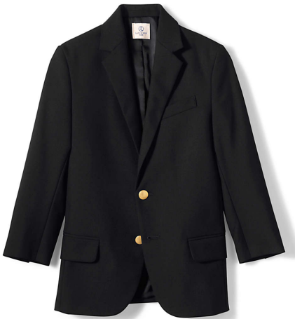
School Uniform Boys Hopsack Blazer Black (Must be monogrammed, Must have at least one for Special Events)