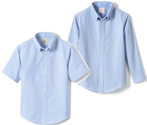
School Uniform Boys Oxford Short/Long Sleeve Blue or White (Must be monogrammed)