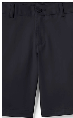
School Uniform Boys Plain Front Chino Short Black