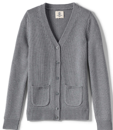
School Uniform Girls Cotton Modal Button Front Sweater Pewter Heather (Must be monogrammed)