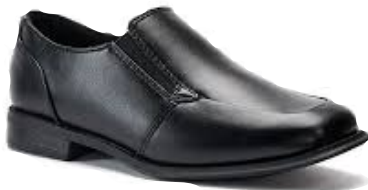
Slip On Shoe or Saddle Shoe Black