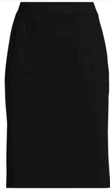
School Uniform Girls Solid A-line Skirt Below the Knee Black