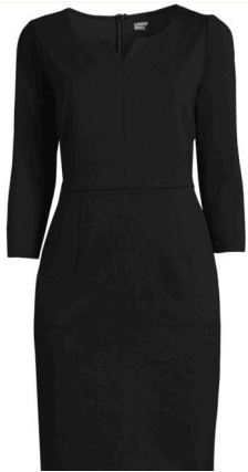
Women's Ponte 3/4 Sleeve Notch Neck Dress Black (No Monogram)