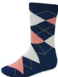
No colored socks other than black No white socks. No patterned socks.