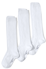
School Uniform Girls Solid Cable Knee Socks White (Does not have to be Lands' End)