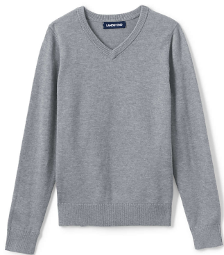
School Uniform Boys Cotton Modal Button V-Neck Sweater Pewter Heather (Must be monogrammed)