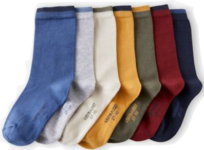
No colored socks other than black No white socks. No patterned socks.