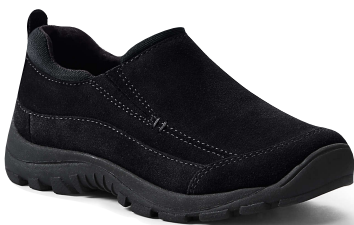
Suede Slip on Moc Shoe Black (Does not have to be Lands' End)