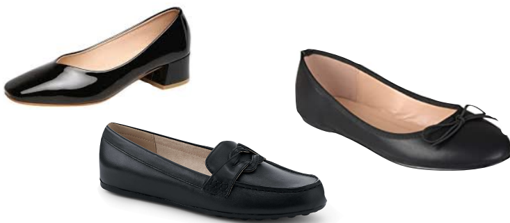
Slip On Ballet Flat Shoe-excludes ballet flats with straps or slip on loafers. Modest, low heel, black, pump style shoe for events.

Black top and sole. Natural or nude pantyhose. (Does not have to be Lands' End)