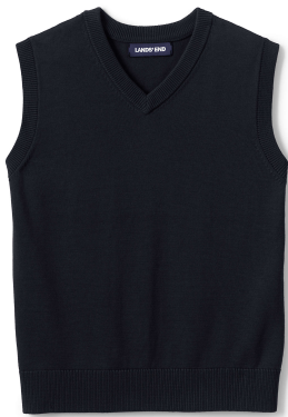
School Uniform Boys Cotton Modal Sweater Vest Black (Must be monogrammed. Must have At least one for Special Events)