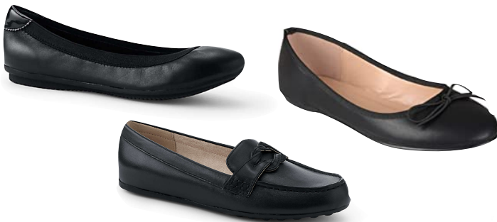
Slip On Ballet Flat Shoe-excludes ballet flats with straps Or Slip on loafers Black top and sole (Does not have to be Lands' End)