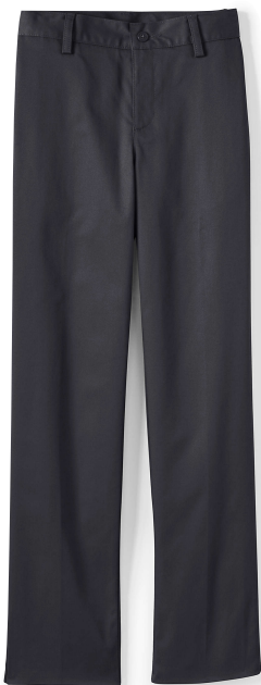
School Uniform Boys Iron Knee Plain Front Chino Black