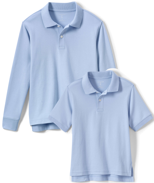
School Uniform Boys Short/Long Sleeve Interlock Polo Shirt Blue or White (Must be monogrammed)