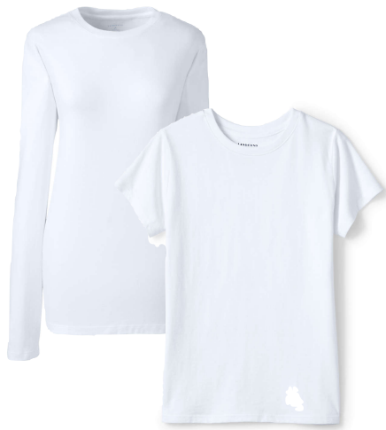
School Uniform Girls Essential T-shirt, Long or Short Sleeve White (Must be monogrammed)