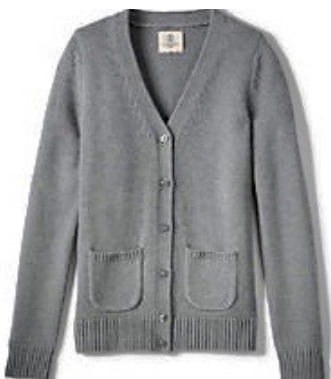
School Uniform Boys Cotton Modal Button Front Sweater Pewter Heather (Must be monogrammed)