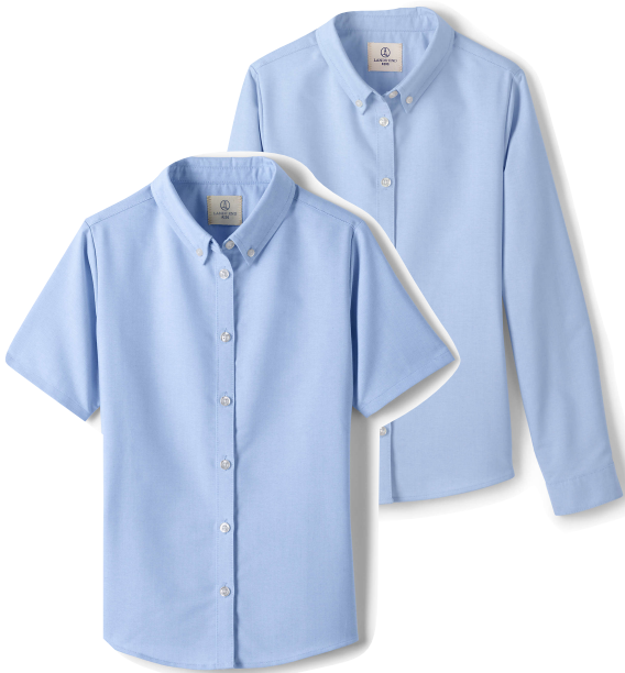
School Uniform Girls Oxford Dress Shirt Long or Short Sleeve Blue or White (Must be monogrammed)