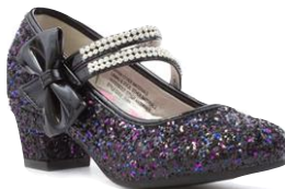
No Sparkly shoes, high heels, boots, shoes with bows, shoes with white soles, sneakers, or tennis shoes