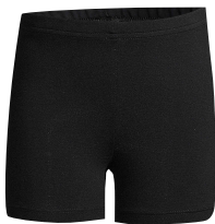
School Uniform Cotton Cartwheel Shorts Black (Does not have to be Lands' End)