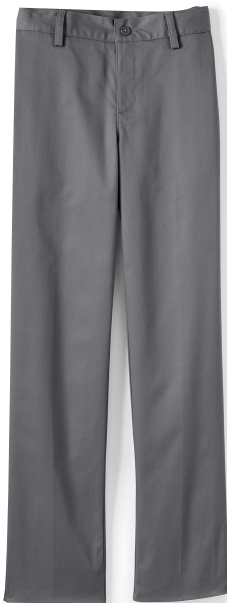
School Uniform Boys Iron Knee Plain Front Chino Arctic Gray