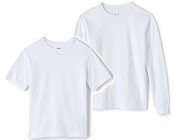
School Uniform Boys Essential T-shirt, Long or Short Sleeve White (Must be monogrammed)

NOTE: Athletic socks and shoes are required for all classes. Athletic shoes do not need to be black. Leggings or spandex biker/yoga bike shorts are not acceptable. K4 is not required to purchase P.E. uniforms.