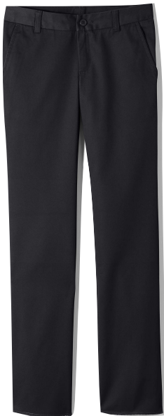
School Uniform Girls Perfect Fit Knee Plain Front Chino (Black) Solid black dress socks must be worn with pants. (Black leather belt may be worn with pants. Does not have to be Lands' End)