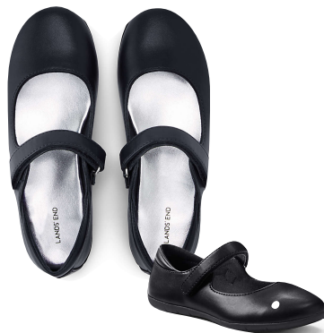
Mary Jane shoes that have one strap straight across the top of the foot- excludes Mary Janes with a zig-zag, multi strap, or T-strap style. Slip On Ballet Flat Shoes (6th grade girls only)-excludes ballet flats with straps Black top and sole