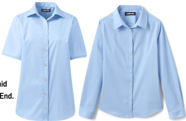
School Uniform Girls No Gape Shirt Long or Short Sleeve Blue or White (Must be monogrammed)