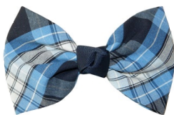
School Uniform Girls Clear Blue Plaid Headband by Lands' End. Or small hair accessories in any of the school Uniform colors are acceptable. (Does not have to be Lands' End)