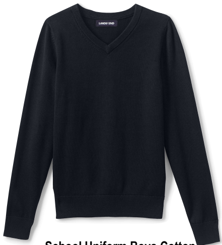
School Uniform Boys Cotton Modal Sweater Black (Must be monogrammed, Must have at least one for Special Events)