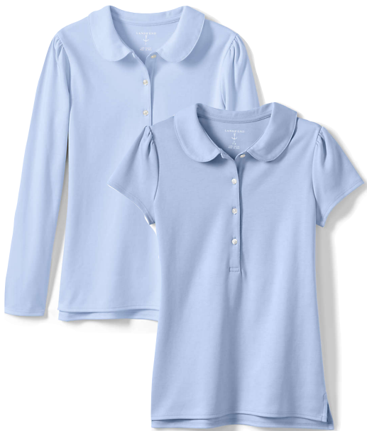
School Uniform Girls Short/Long Sleeve Peter Pan Collar Shirt Blue or White (No monogram if wearing under jumper)