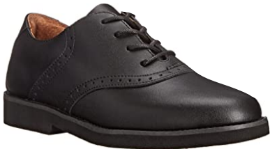
Slip On Shoe or Saddle Shoe Black