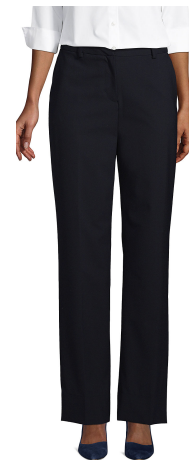
School Uniform Women's Washable Wool Plain Comfort trousers Natural or nude knee-highs to be worn with pants.